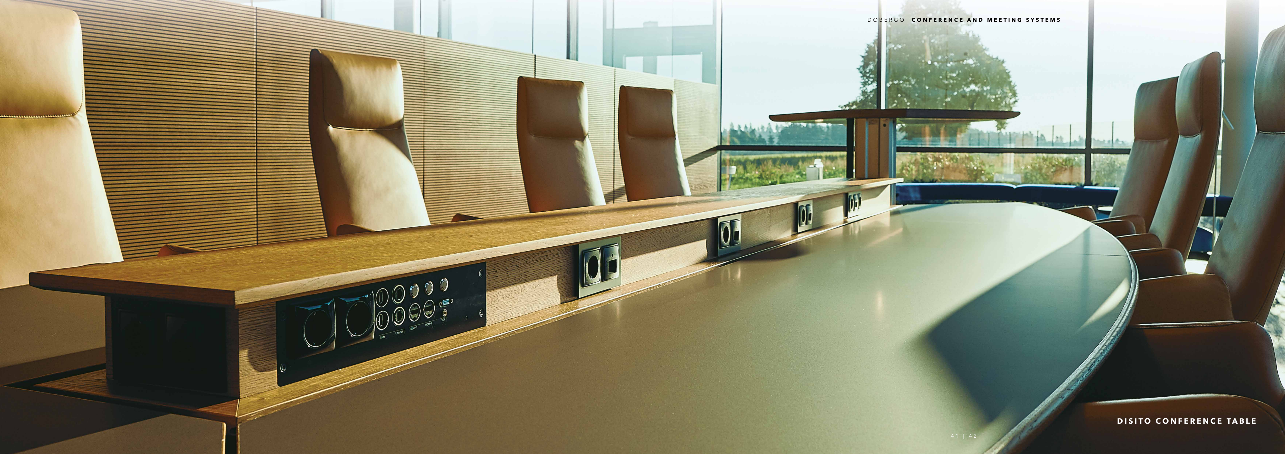
DISITO CONFERENCE TABLE